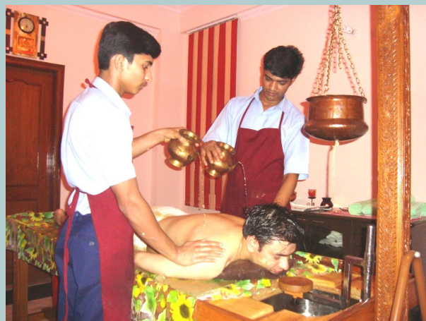
Panchkarma Treatment at Bliss Ayurveda Health Center

www.blissayurveda.com/Healthcenter_Inresidenceprogram.html