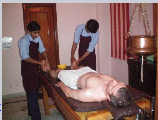
Panchkarma treatment at Bliss Ayurveda Health Center

For details log on http://www.blissayurveda.com/Healthcenter_Inresidenceprogram.html